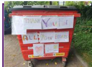
Message for our bin men from our key worker children.

The Prophet ﷺ taught us a few simple words to say for Laylatul-Qadr. Aisha (ra) said: "O Messenger of Allah! What if I knew which night Laylatu-Qadr was, then what should I say in it?" He ﷺ said: "Say: "Allahumma innaka 'afuwun tuhibbul 'afwa fa'fu 'annee." which means: O Allah you are the one Who pardons greatly, and loves to pardon, so pardon me. Are there any signs to help us know that Laylatul-Qadr has taken place? The simple answer is: Yes. The Messenger of Allah ﷺ described the morning after Lailatul-Qadr, so that Muslims may know which day it is. He ﷺ said: "On the morning following Laylatul-Qadr, the sun rises not having any rays, as if it were a brass dish, until it rises up." [Muslim, Abu Dawood, Tirmidhi, ibn Majah]