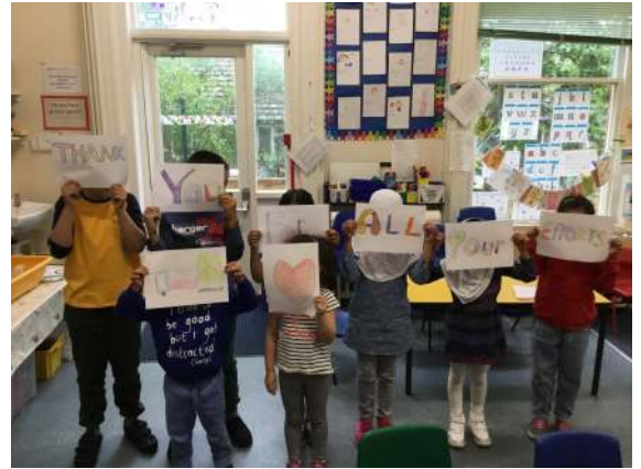
The pupils wrote a message for our bin men to thank them for their continued work.,

The calamity we are finding ourselves in has brought sorrow and fear to many, but it also comes with so many blessings as we are developing gratefulness and gratitude for people and our everyday life that we took for granted. We pray that Allah swt gets us through these difficult times and that once this is over, by His Will, the gratitude that we are developing now, will remain with us for ever.